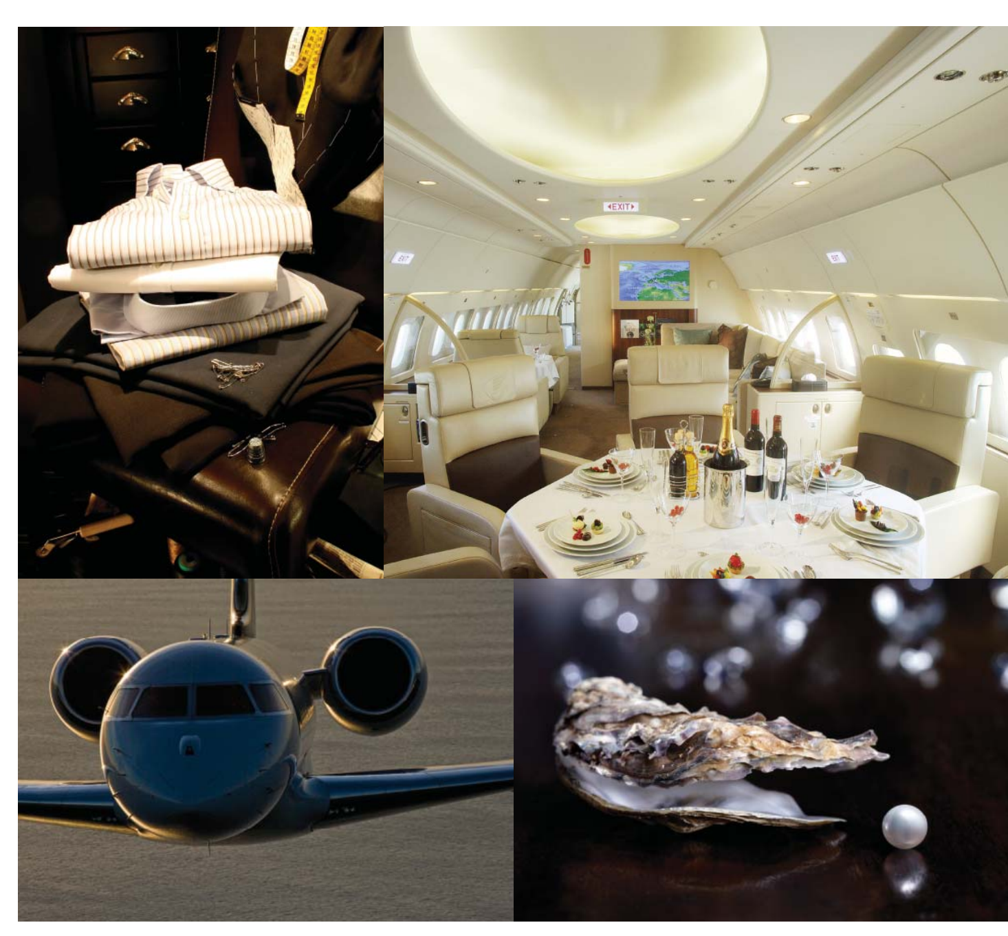
Top right: Airbus ACJ interior – operated by Comlux. Bottom left: Global 5000 – image reproduced courtesy of Bombardier.

By assessing and analysing these, ConnectJets is able to present bespoke options to accurately match your business' travel specification. Maximising your budget, and reassuring you of the perfect service every time.